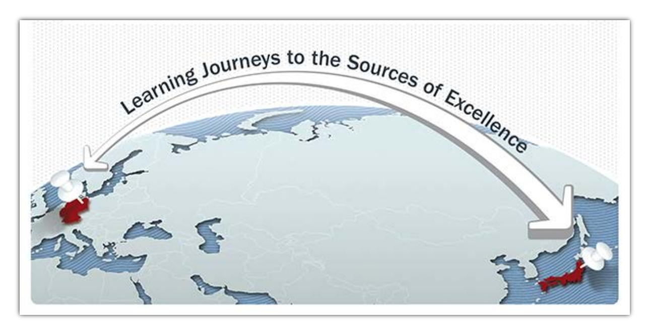
Seminar 'Lean Production and Management - Operational Excellence of Companies in Japan'

Our Benchmark Training Journey is scheduled for the duration of 8 days . It starts on a Saturday and ends on the Saturday of the following week (departure from Europe on Friday, return and arrival in Europe on Sunday of the following week, see example below).